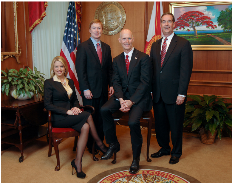
Rick Scott, Governor